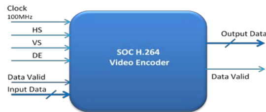
Fig. 2 The inputs and outputs of the H.264 video encoder IP Core

The H.264 4k video encoder IP core integration details are provided in a separate document under the title of “H.264 4k Video Encoder IP Core Integration Sheet”.