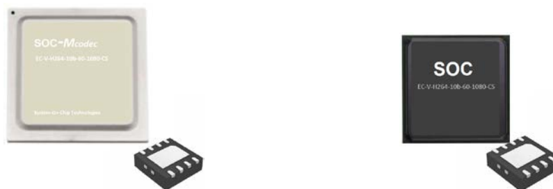
Fig. 5 SOC-Mcodec chipsets

The SOC H.264 4k Encoder Chipset includes an FPGA and FLASH preconfigured with SOC's H.264 4k Encoder IP Core. It is an ASIC that receives raw video/audio and outputs an H.264 video stream with optional AAC/MP2/MP3 audio compression. It supports resolutions up to 4k at 120 fps.