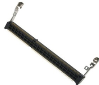
Fig. 4. Device-to-PCB connectors