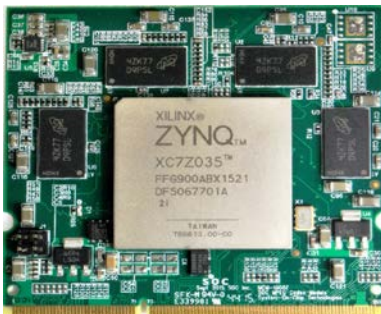
Fig. 3 SOC MPEG Codec Module

Refer to the Product Brief and Datasheet of SOC MPEG Codec Modules for technical details.