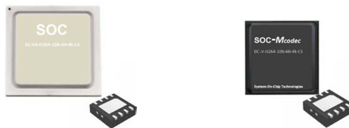
Fig. 5 SOC-Mcodec chipsets

The SOC H.264 4K Decoder Chipset includes an FPGA and FLASH preconfigured with SOC's H.264 4k Encoder IP Core. It is an ASIC that receives raw video/audio and outputs an H.264 video stream with optional AAC/MP2/MP3 audio compression. It supports resolutions up to 4K at 60 fps.