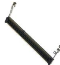
Fig. 4. Device-to-PCB connectors