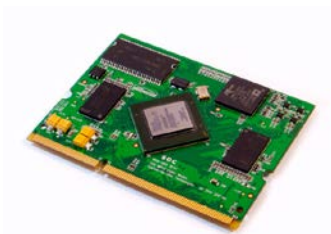
Fig. 3 SOC MPEG Codec Module

Refer to the Product Brief and Datasheet of SOC MPEG Codec Modules for technical details.