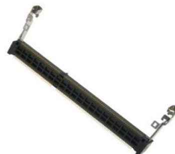
Fig. 4. Device-to-PCB connectors