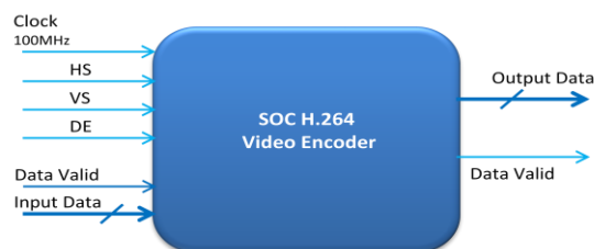
Fig. 2 The inputs and outputs of the H.264 video encoder IP Core

The H.264 8k video encoder IP core integration details are provided in a separate document under the title of “ H.264 8k Video Encoder IP Core Integration Sheet ”.