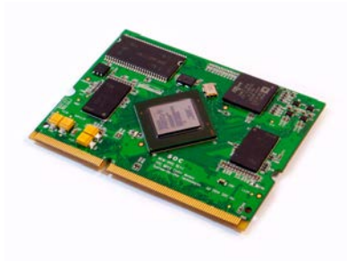
Fig. 5 SOC MPEG Codec Module