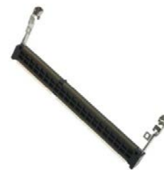
Fig. 6. Device-to-PCB connectors